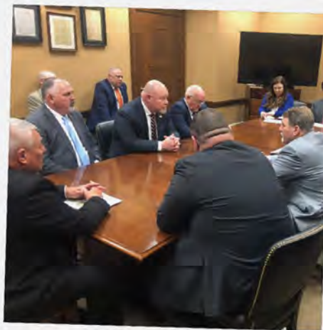
WASHINGTON D.C. TRIP