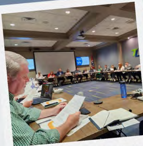
UC STRATEGY SESSIONS