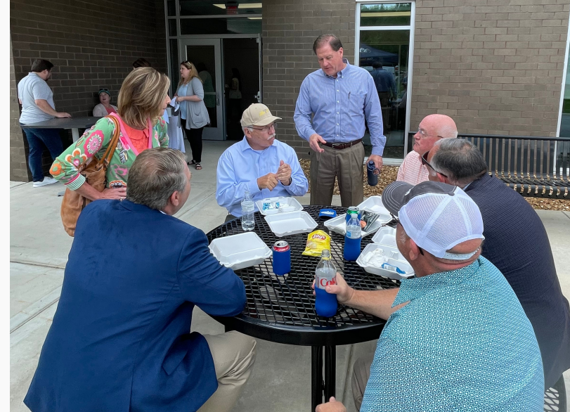
May 6, 2022 | Issue 17