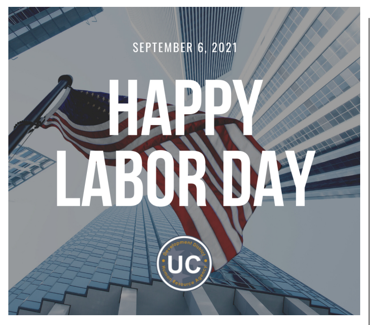
In observance of Labor Day, our office will be closed Monday, Sept. 6. We will reopen at 8 a.m. on Tuesday. Have a safe and happy Labor Day weekend and holiday!