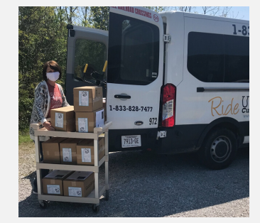
Pictured: Pam Parker is loading up meals for delivery in Macon County